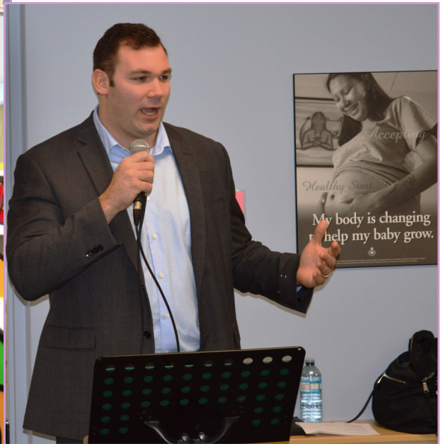
Pictured above, MP Alex Nuttall at the Barrie Ontario Early Years Centre.